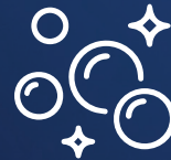
BIO-SURE PLUS™ Filter

Reduces dissolved solids, pharmaceuticals, and metals.