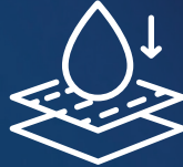
Reverse Osmosis Membrane

Reduces chlorine, chemicals, and pesticides.